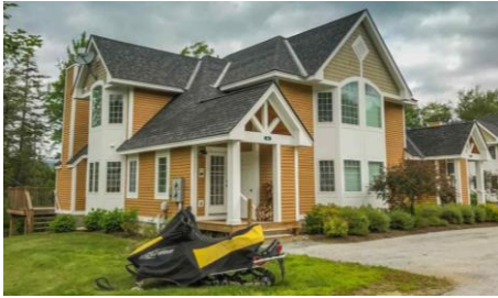
Kingswood at Mount Snow West Dover, Vermont